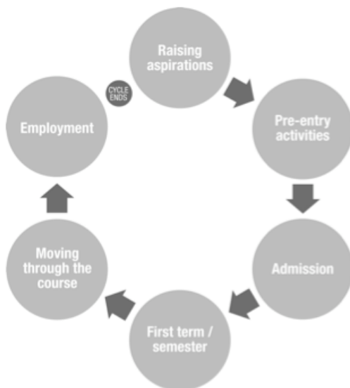
Figure 1 The Student Lifecycle Model: Adapted from list in HEFCE, 2001:15

All students need to progress through three broad stages: settling in; progressing through their studies and preparing to leave. The traditional student lifecycle model illustrates this journey (see figure 1).